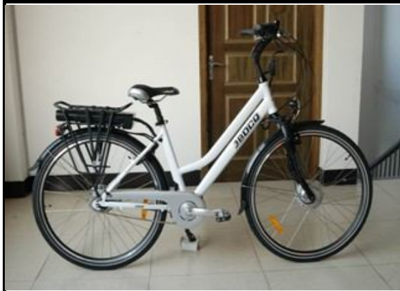
PvEB-B02Z Electric city Bike