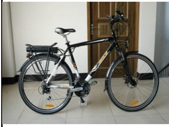
PvEB-B03Z Electric city Bike