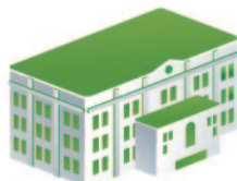
On-grid commercial/ industrial roof-tops