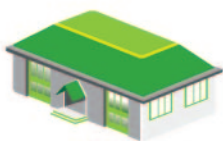
On-grid residential roof-tops